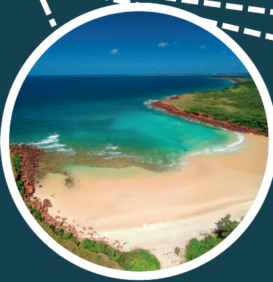
Bariṅura (Little Bondi Beach)