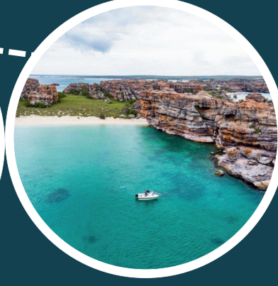
Groote Eylandt