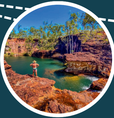
Gapuru (Memorial Park)