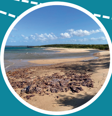
Gumuniya (Buffalo Creek)