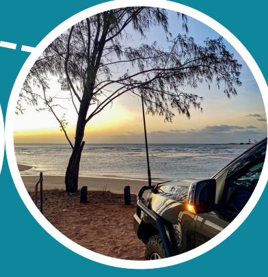
Lombuy (Crocodile Creek)