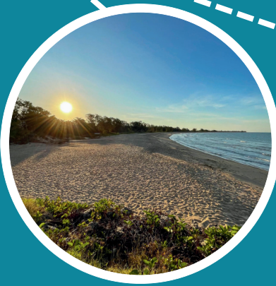
Gaḍalathami (Town Beach)