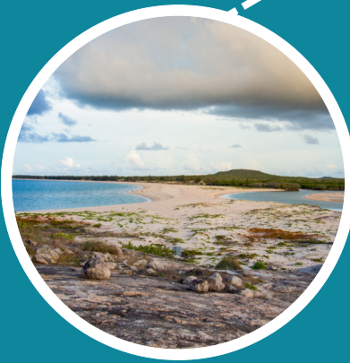
Gäluru (East Woody Island)