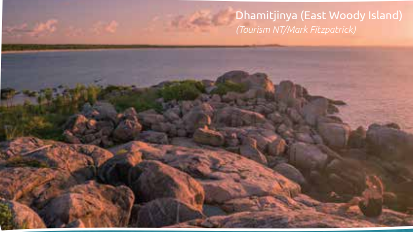
Dhamitjinya (East Woody Island)