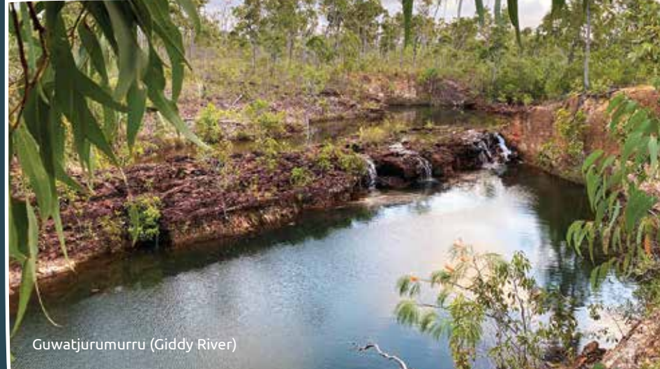
Guwatjorumurru (Giddy River)