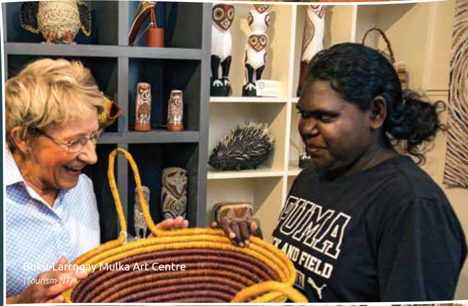
Buku-Larrngay Mulka Art Centre

East Arnhem Land is Aboriginal land which means it is private land but traditional owners welcome visitors to the region and recreation areas. Access permits are required to visit all areas in East Arnhem Land, with the exception of the township of Nhulunbuy and Gove Airport.