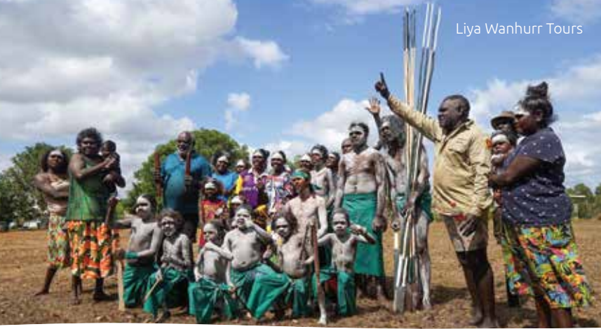
Liya Wanhurr Tours