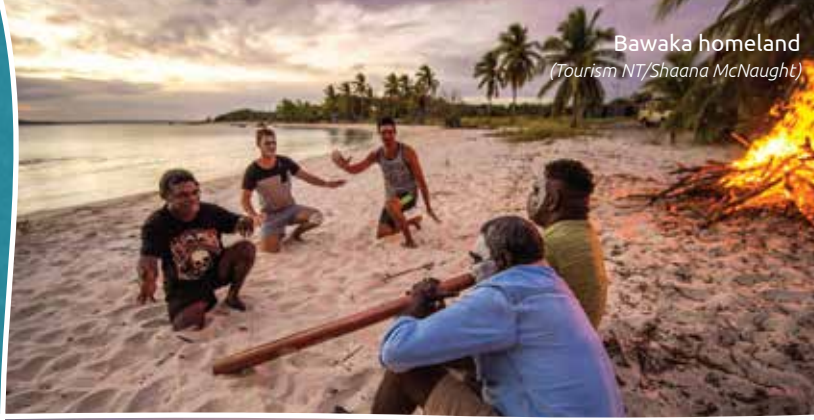
Bawaka homeland

The Gove Peninsula is at the northeastern corner of Arnhem Land. The vibrant community of Nhulunbuy operates as a service and business hub for the Gove Peninsula and East Arnhem Land, and many visitors choose to base themselves in Nhulunbuy to explore the beautiful region.