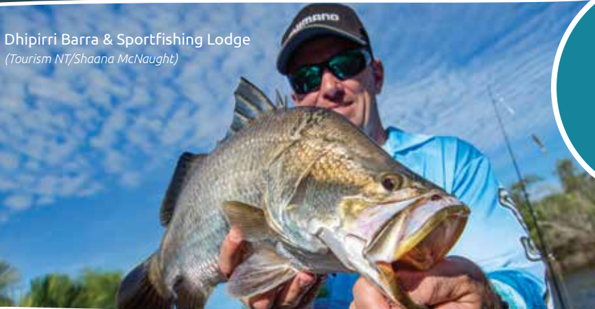
Dhipirri Barra & Sportfishing Lodge