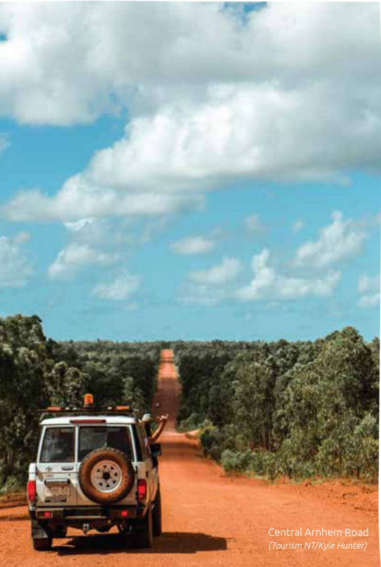
Central Arnhem Road